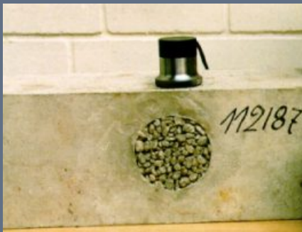
Testing a concrete specimen with gravel pocket with echo-technique