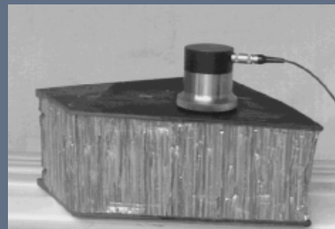
Echo-technique testing of a CFRP-sandwich specimen with aluminium core