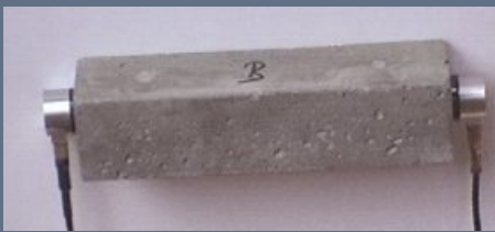
Determination of the Young's-modulus of a mortar specimen in through-transmission technique