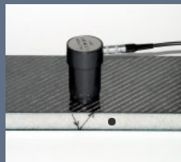
Echo-technique testing of a CFRP-sandwich specimen with foam core