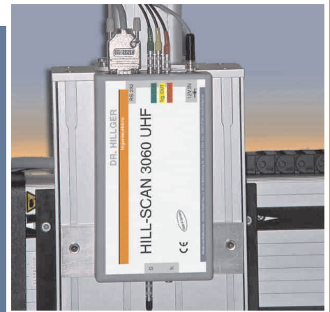
Pulser/ receiver unit mounted at the scanner

The ultrasonic imaging system USPC 3060 UHF is optimized for the testing with high frequencies and delivers high resolution B-, C-, D- and F- scans. It consists of a scanning system with water tank and the external pulser-/receiver module as well as a 19"-rack with scanner controller and the ultrasonic system and monitor, keyboard and mouse.