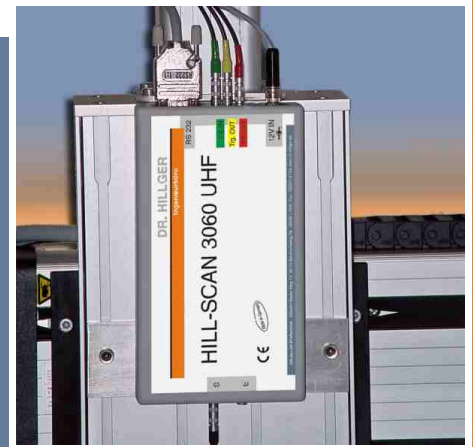
Pulser/ receiver unit mounted at the scanner

The ultrasonic imaging system USPC 3060 UHF is optimized for the testing with high frequencies and delivers high resolution B-, C-, D- and F- scans. It consists of a scanning system with water tank and the external pulser-/receiver module as well as a 19"-rack with scanner controller and the ultrasonic system and monitor, keyboard and mouse.