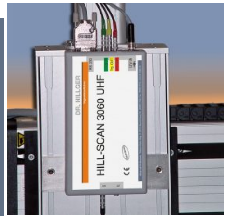
Pulser/ receiver unit mounted at the scanner

The ultrasonic imaging system USPC 3060 UHF is optimized for the testing with high frequencies and delivers high resolution B-, C-, D- and F- scans. It consists of a scanning system with water tank and the external pulser-/receiver module as well as a 19"-rack with scanner controller and the ultrasonic system and monitor, keyboard and mouse.